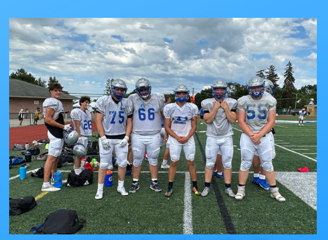
Varsity Football First game against Oxford on 8-25-23!!

Apply for Parking Permit Using student UCS laptop