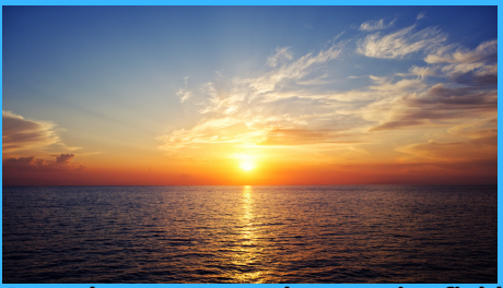
Pancakes @6:40 on the practice field Sunrise @ 7:04